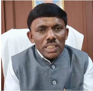
delegation recently met Union Home Minister Amit Shah and urged the

Centre to address the long-pending demand for political reservation for Scheduled Tribes in the state.