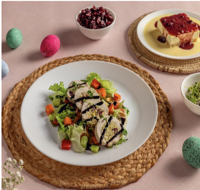
moments of delight and discovery.

The offering reflects Café Akasa's continuous endeavour to redefine the in-flight dining experience by moving beyond functionality to create