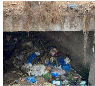
environmental violations and illegal land filling

MAPUSA: Officials of the Goa State Pollution Control Board (GSPCB) conducted an inspection at the Mapusa market sub-yard after a complaint was filed by the civic group Together for Mapusa over alleged