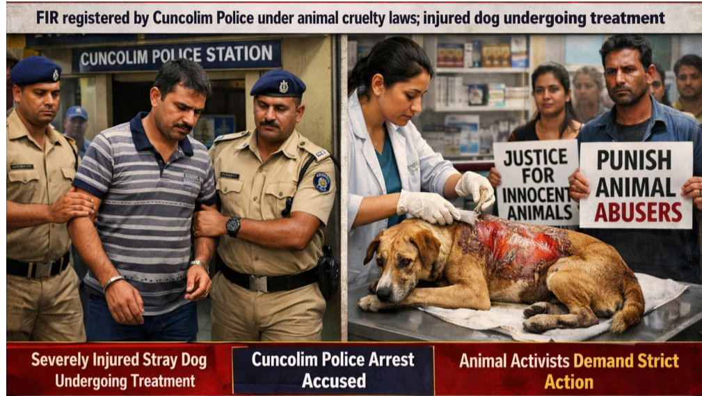
Severely Injured Stray Dog Undergoing Treatment