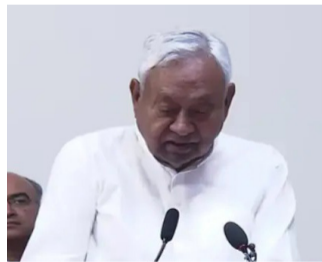
as a Member of the

lineup, though no official names have been declared yet. Widely regarded as Bihar's longest serving Chief Minister, Kumar has had a long and influential political career. He began his journey