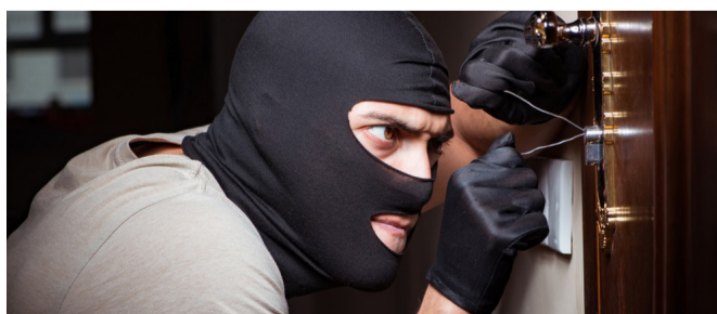
They also broke open the lock of a store room