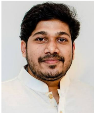
Referring to the recent