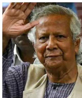
Yunus, who led the

New Delhi: Facing mounting criticism at home, Bangladesh's outgoing Chief Adviser Muhammad Yunus used his farewell address to project a firm foreign policy stance, asserting that the country had restored its sovereignty and was no longer influenced by external directives.