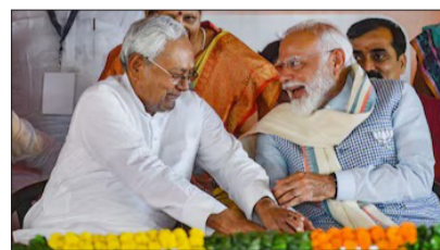
Kumar's Janata Dal (United) an edge over its ally, the Bharatiya

New Delhi: Exit polls from the 2025 Bihar Assembly elections suggest a comfortable victory for the National Democratic Alliance (NDA), with Chief Minister Nitish Kumar emerging as a major beneficiary of the verdict. The Matrize exit poll indicated a reversal of fortunes compared to 2020, giving Nitish