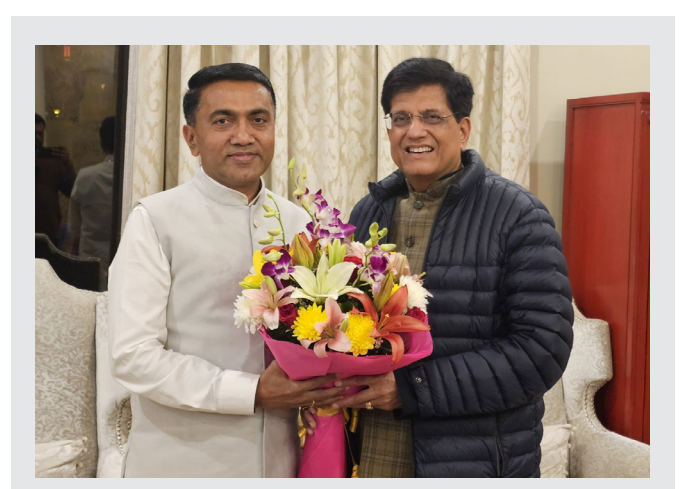
CM Pramod Sawant met & interacted with Union Minister of Commerce & Industries Piyush Goyal at New Delhi.

Residents of Bhatlem have expressed their frustration and disappointment over the lack of immediate response from the authorities. The community is seeking prompt action and compensation for the losses suffered due to the flooding. The incident has highlighted the need for better maintenance and oversight of the water infrastructure in the area.