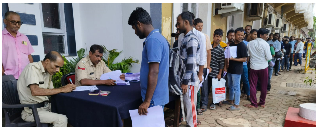
Heavy rush near Panaji police station as Goa government has made tenant verification mandatory for all tenants.

Officials from Anjuna Police have emphasized that anybody caught in breach of immigration laws will face severe consequences and that measures would be taken to discover and handle such incidents in the future.